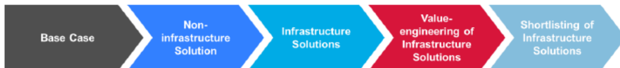
Figure 3: Options development process