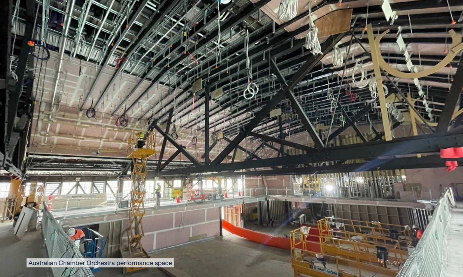
Australian Chamber Orchestra performance space