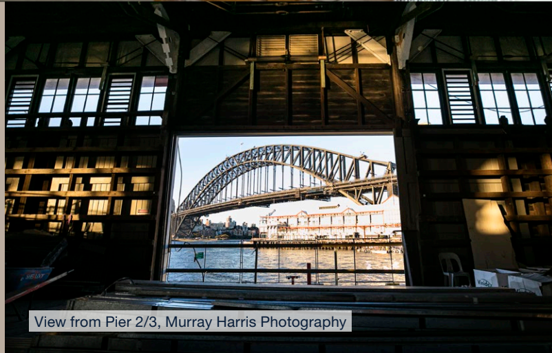
View from Pier 2/3

Last month Create NSW, Infrastructure NSW and Richard Crookes Constructions conducted a site tour for the soon to be resident companies of Pier 2/3. We were delighted to take representatives from Bell Shakespeare, Australian Chamber Orchestra and Australian Theatre for Young People through the construction site. Site tours are conducted quarterly to show the tenants how their spaces are developing.