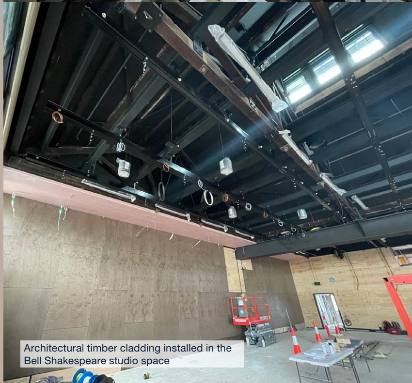
Architectural timber cladding installed in the Bell Shakespeare studio space