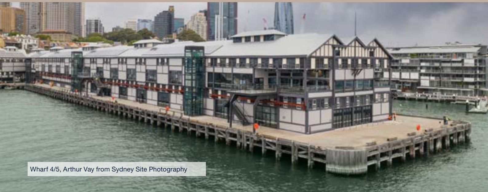
Wharf 4/5, Arthur Vay from Sydney Site Photography

The rejuvenation of Wharf 4/5 is a significant boost to the NSW arts sector and audiences longing to return to the performing arts, taking the Walsh Bay Arts Precinct one step closer to being Australia's premier arts destination. Construction at Pier 2/3 is well underway and will continue as scheduled.